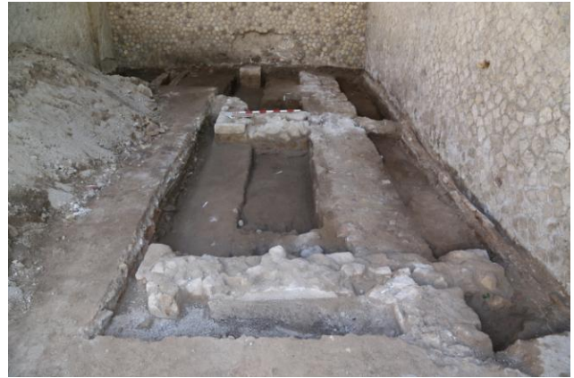
Fig. 5. Unit 15 viewed from the south with the parallel foundation walls. Note how the foundation on the right (east) cuts through the perpendicular cross-walls associated with the previous architecture (left).