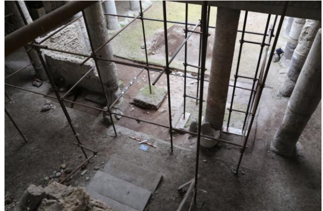
Fig. 10. Overview unit 9. Note the pavement into the courtyard and the channel on the upper left.