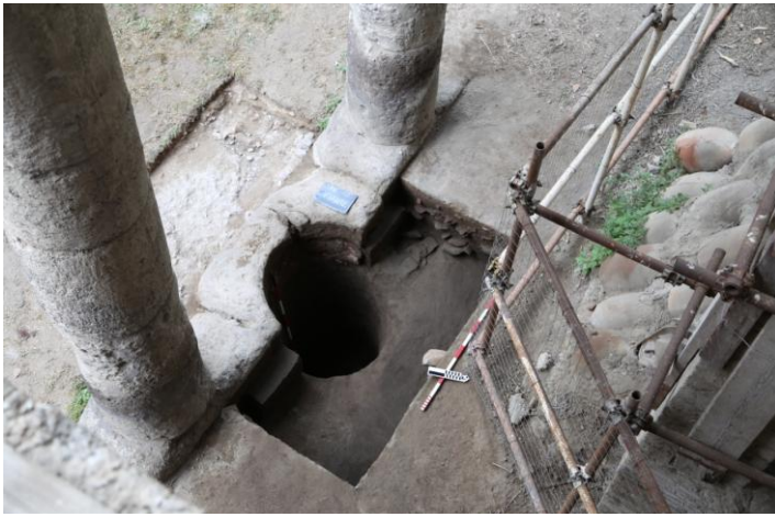
Fig. 12. Overview unit 10.