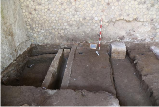
Fig. 7. Unit 15 view of the two water features on the left.