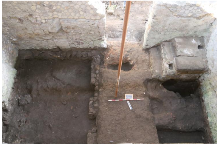
Fig. 14. Overview unit 16. Note the traces of the demolished partition wall on the left and the exposed cuts on the right.

The evidence we have sketched out so far suggests a partial disruption of the water system and a shift in function of the complex with the construction of the barrel-vaulted storage rooms. The reason for this change is probably associated with the earthquakes and geological phenomena that devastated the area after 62 CE. Bradyseism in particular may be to blame. This is a well-known occurrence in volcanic areas, where the filling or emptying of magma chambers can lead to landscapes shifting several meters in a relatively short period of time. At Oplontis B our geologist Giovanni di Maio has documented such a drastic lowering of the topography by about two meters as a result of such activity in 62 CE or soon thereafter 12 . Similar ground movements seem to have finally cut the water supply to Pompeii in the years before the eruption. Bradyseism probably lowered Oplontis B—which already was close to sea level—so much that the cistern and nearby aquifers became contaminated with seawater, rendering it unusable. The subsequent barrel vaults seem to be a response to the changing environment, and signal a renewed economic development in the years leading up to the eruption.