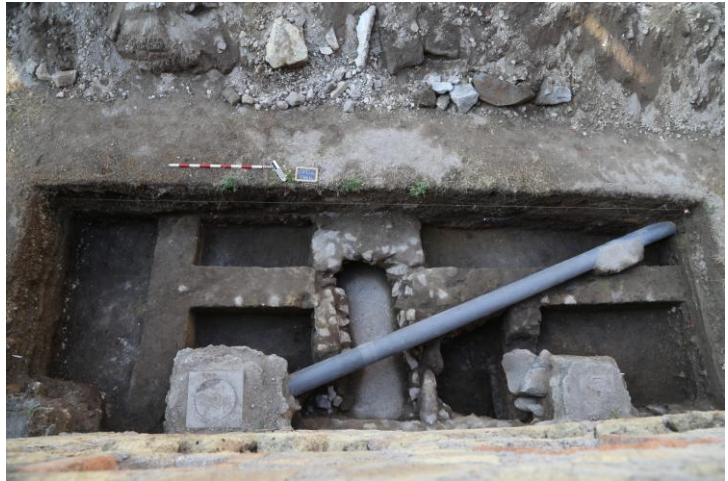
Fig. 3. Overview of unit 6. The sewer runs through the center of the unit and cuts through the previous architecture.

It is only in the third phase, that the owner of the site decided to add the barrel-vaulted storage spaces visible today. Our initial interpretation of the excavated materials suggests that the space dates roughly to the mid-first century CE. If we follow Frölich's recent re-evaluation of the masonry style, then the quoins of some of the doorways opening into the storage spaces composed of opus vittatum mixtum seem to substantiate this date 6 . The new rooms cut through the sewer, rendering it unusable. Nevertheless, the main floor level on the exterior of the new spaces remained unchanged. Unlike the modern layout of the area, we discovered that in antiquity the pavement on the interior of the storage spaces was about 10 centimeters higher than that of the exterior. This setup seems consistent with the function of storage spaces. The height difference would have contributed to keeping out moisture and it allowed for easier cleaning. A series of burn patches on the exterior pavement signal the transition to the fourth and final phase, marked by the deposition of a new floor level. The artifacts recovered in the fill place its use and formation to the last phase of the site before the eruption.