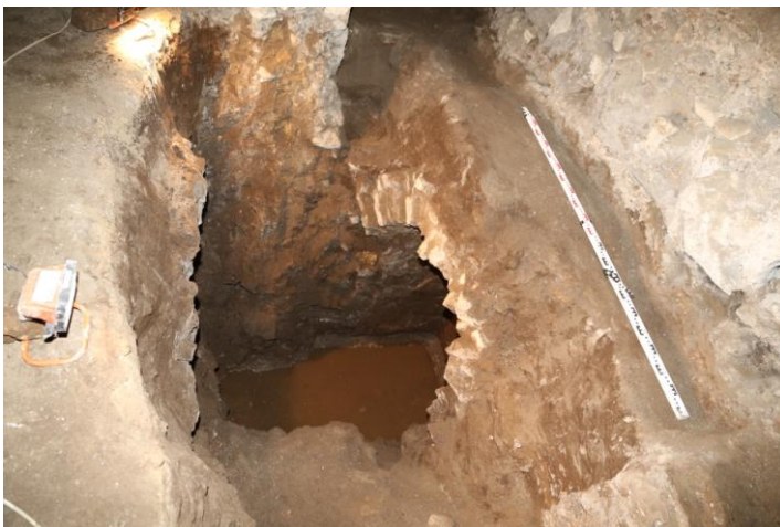
Fig. 13. Overview of the unit 14 with the cistern below.

underground barrel vaulted cistern. We designated the largest hole in spaces 41 and 17 as trench 14 (fig. 13); a smaller void in space 26 became unit 13. Trench 14 marks the spot where according to the Italian excavation dairies the floor and walls above had collapsed into the cistern during the eruption, whereas unit 13 marks an evaluation trench dug during the reconstruction effort in the 1980s. Today a thick ancient earthen deposit fills much of the cistern, surmounted by a layer of modern concrete. When the construction works for a school in the 1970s first discovered the remains of Oplontis B, the company responsible for preparing the site bored a series of holes to fill with concrete as foundation pylons. Workers accidentally bored through the ceiling of the cistern and inadvertently filled in part of the remaining void with concrete, making any sort of further excavation difficult.