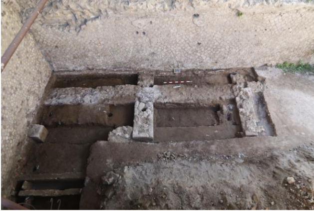
Fig. 4. Overview of unit 15. Note the foundation walls running through the center and the east of the unit.