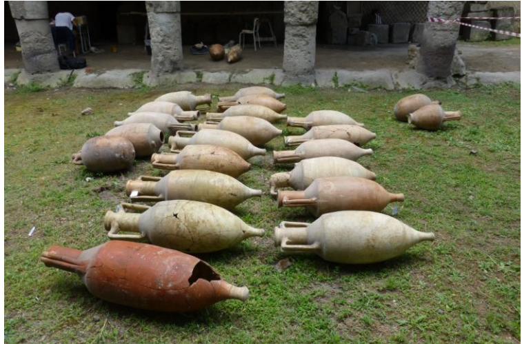
Fig. 16. Amphorae laid out for cataloging in the courtyard of Oplontis B.

complex along with many more amphorae and special finds from Oplontis B housed in Villa A and its magazzino (storage room). Another challenge has been working with legacy data that the Oplontis team did not excavate and attempting to understand and locate the provenience of the stored assemblages. Fortunately, we have been able to cross-reference the giornali di scavo (excavation diaries) of the original excavators and their finds inventory for Oplontis B with the information and dates on the un-inventoried material. In addition to the archival written material, we have also had the gracious cooperation of one of the original principal excavators of Oplontis B, dottoressa Adele Lagi De Caro, who has given the project valuable eyewitness information regarding the positioning of the amphorae and other finds when they were originally uncovered.