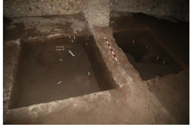
Fig. 8. Overview of unit 17. Room 2 is on the left and Room 3 on the right.

phase; they cut through the previous architecture (circled in red in fig. 7). Their arrangement, three aligned down the center with three outliers at right angles, suggests that the posts held up scaffolding associated with the construction of the barrel vault. Workers took it down when they finished the room with a thick opus signinum (concrete) floor, thereby converting the room into a storage space in its final fourth phase. Above it, the owner then renovated the second floor with the addition of a new space embellished with a simple Fourth-Style fresco.