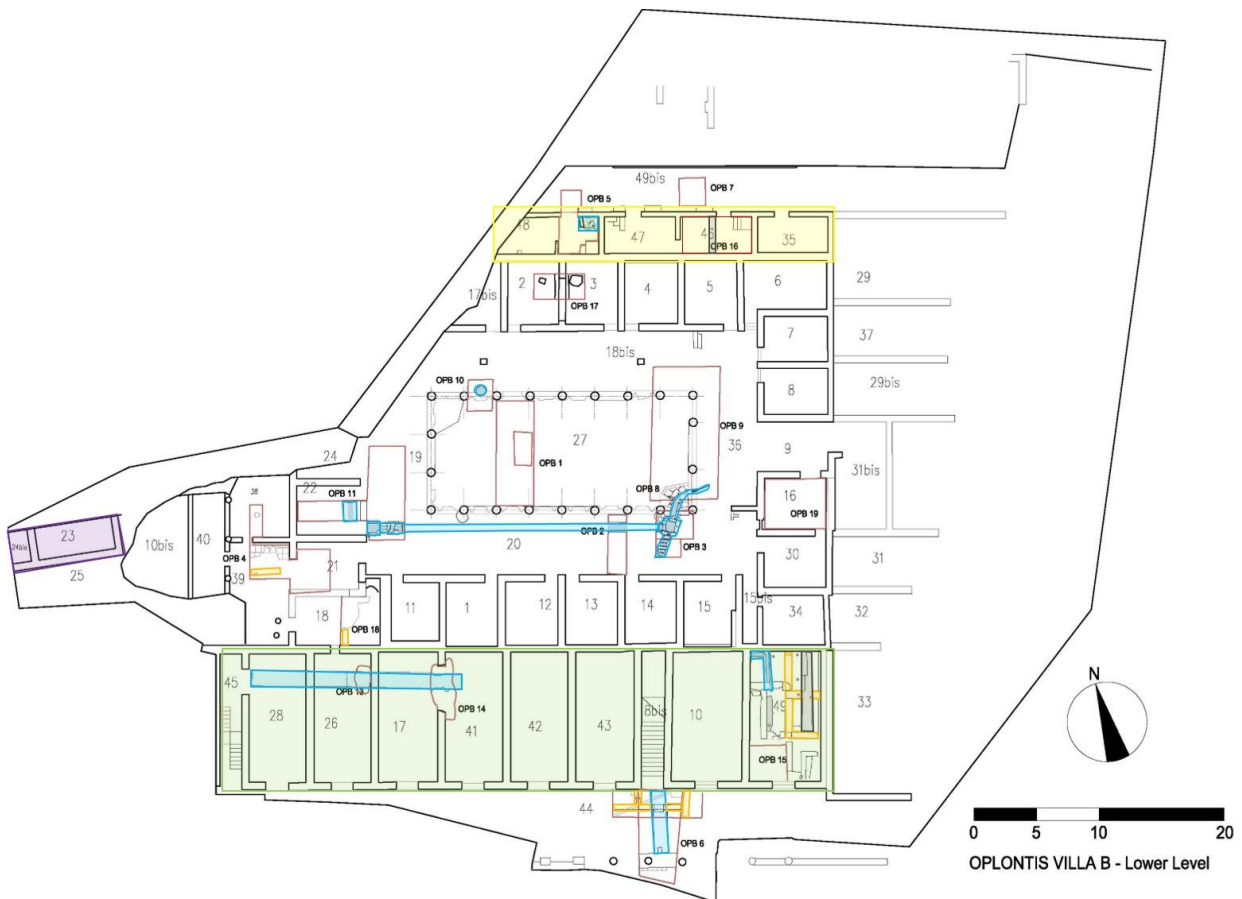
Fig. 1. Plan of Oplontis B with trenches 1-19 outlined in red. The barrel vaulted storage spaces are marked in green; the townhouses in yellow; a separate building to the west in purple. Water features are marked in blue, whereas first phase architecture is highlighted in orange and second phase is colored grey. Plan by J. Galloway.