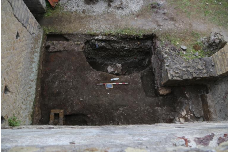
Fig. 15. Overview unit 18. Note the large pit cut in the center of the unit and the shallow foundation wall on the left.