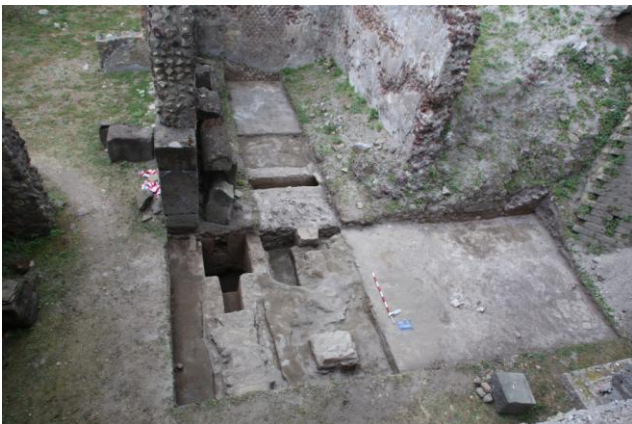
Fig. 11. Overview unit 11. Note the basin and the two water-channels on the left and top center.

up to the final configuration of the room. Although the provenience of the tiles remains obscure, it is likely that they belonged to one of the earlier spaces recovered in trenches 6 and 15 to the south.