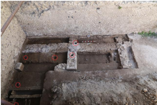
Fig. 6. Unit 15 viewed from above with the postholes circled in red.

wall running in a north-south direction through the middle of the unit marked the first phase (fig. 4). The foundations, included three squat square piers composed of mortared tuff bricks. Spaced roughly 2.5 meters apart, they probably supported column shafts, suggesting that the foundations were once part of a portico-like structure oriented toward the west. Two of these piers were at the head of cross-walls that designated separate spaces whose purpose for now remains unknown.