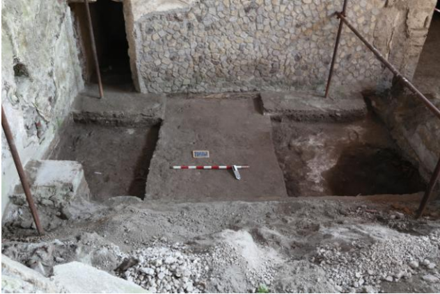
Fig. 9. Overview unit 19.