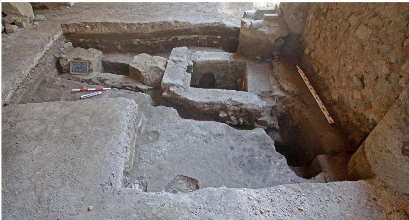
Fig. 7. View of Trench OPB 3 from the east .