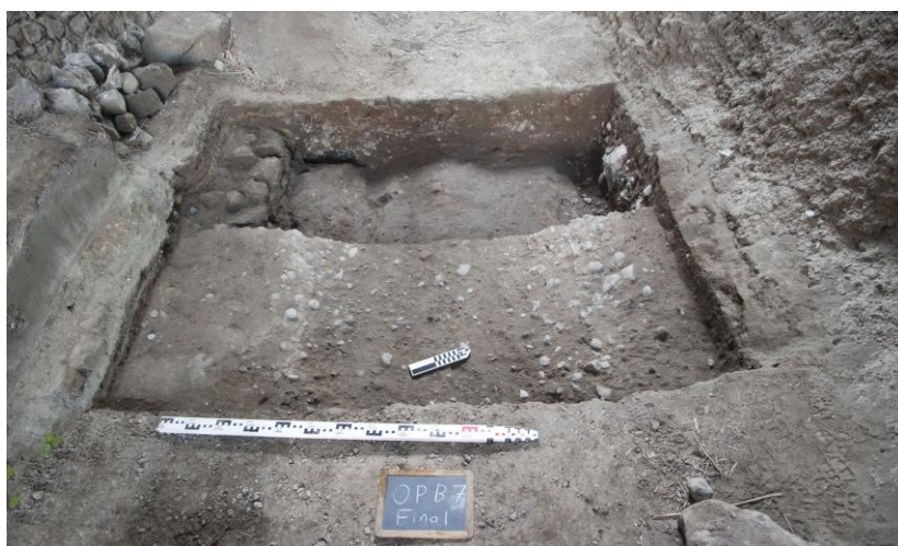
Fig. 13. View of Trench OPB 7 from the north .

hindering further assessment of what was beyond this portico. Of note were the remains of a column capital belonging to the southern colonnade still in situ from its collapse during the eruption. Excavation also revealed a large T-shaped intersection of drains that likely registered as one of the anomalies recorded by the geoprospection team. The position of this sewer system suggests that it may have connected to the one that exits OPB3. The sewer awaits further excavation but an initial examination of the southern section of the drain discovered that it was barrel-vaulted.