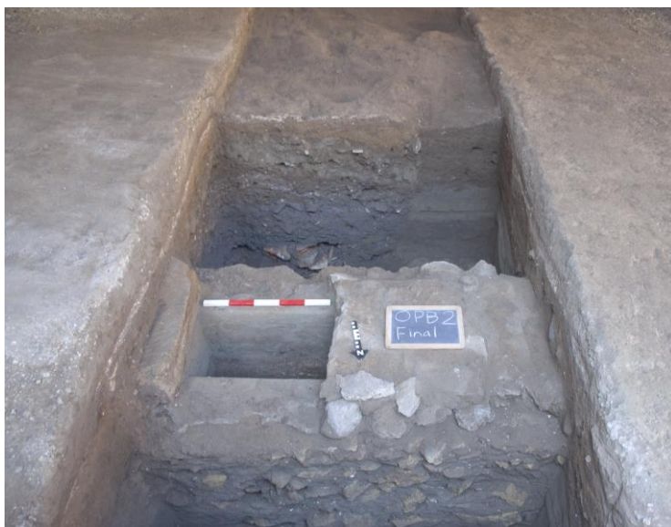
Fig. 6. View of Trench OPB 2 from the north.

The north and south ends of the trench, revealed interesting details of the colonnade's construction (fig. 5). Here the foundations consist of a thick tufa stereobate which sits atop perpendicularly positioned foundation blocks spaced to coincide with the joins between the blocks of the stereobate. A section of foundation in opus incertum supports the center join. The entire assemblage rests on the same pyroclastic stratum supporting the courtyard pavement. On the southern edge of the peristyle the foundation trench fill for the colonnade contained several sherds of Campana A Black Gloss ceramic. Its broad range of production includes the entire 2nd Century BCE, a timeframe consistent with our preliminary estimates for the courtyard building.