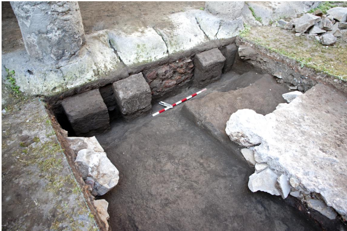
Fig. 5. Trench OPB 1 with detail of colonnade foundations.

The north and south ends of the trench, revealed interesting details of the colonnade's construction (fig. 5). Here the foundations consist of a thick tufa stereobate which sits atop perpendicularly positioned foundation blocks spaced to coincide with the joins between the blocks of the stereobate. A section of foundation in opus incertum supports the center join. The entire assemblage rests on the same pyroclastic stratum supporting the courtyard pavement. On the southern edge of the peristyle the foundation trench fill for the colonnade contained several sherds of Campana A Black Gloss ceramic. Its broad range of production includes the entire 2nd Century BCE, a timeframe consistent with our preliminary estimates for the courtyard building.