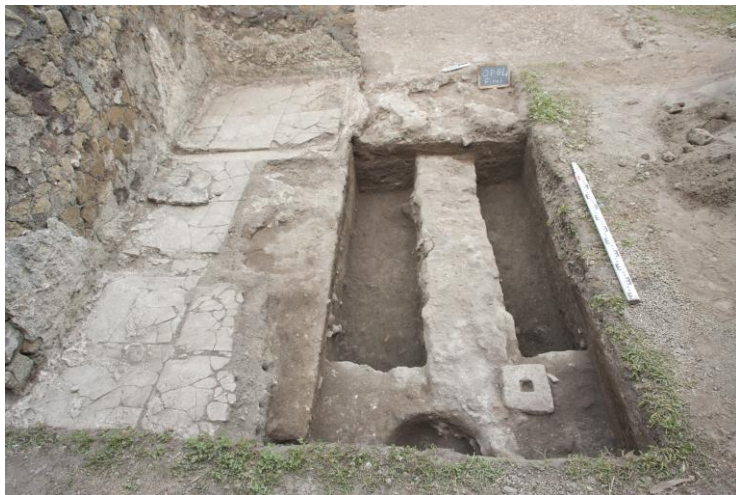
Fig. 9. View of Trench OPB 4 from the west, with possible water conduit in the foreground.