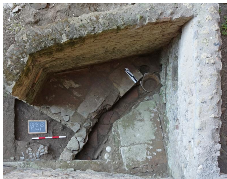
Fig. 8. View of Trench OPB 8 from the south.

maintenance. Inside the channel, two distinct strata completely filled the void. The top stratum was a grey ash matrix that represented fill from the 79 eruption. The second lower deposition was a brown, clay-like matrix containing the occasional sherd, including a small fragment of stamped Arretine ware; this lower stratum represents the sludge and detritus from pre-eruption use. Levels taken within the channel indicate that it was draining west to east.