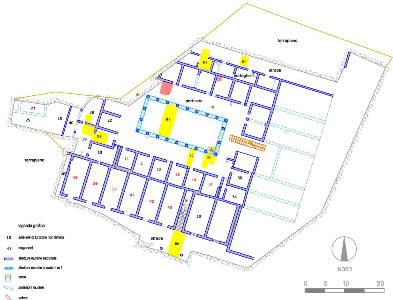
Fig. 1. Plan of Oplontis B with 2012 and 2013 Trenches.

Though located very near a luxurious and sprawling pleasure villa, Oplontis B is strikingly different in what it preserves, and from its remains we can also surmise that it had a very different function from its opulent neighbor. Whereas Villa A is clearly a luxury villa designed for otium , or leisure, Oplontis B was a site focused on commerce, most likely a distribution center for wine 5 . Its spaces - sparse and utilitarian - are meant not for leisure but for negotium , or industry. Beyond the unique physical structure of Oplontis B, perhaps the most significant aspect of this site is the fact that it preserves unparalleled material for new study in several underrepresented areas, including human remains, foodstuffs, coins, jewelry, and transport vessels.