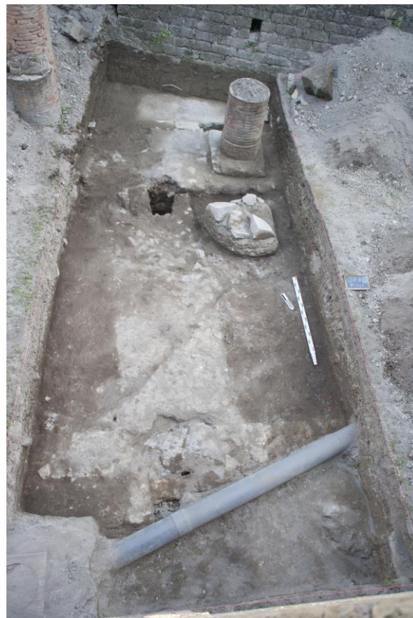
Fig. 10. View of Trench OPB 6 from the north. The lighter T-shaped mark in the pavement at the center of the trench is the sewer system.

clues that point to other possible uses 9 . Importantly, the channel and seating area one would expect for a latrine of this size are missing.