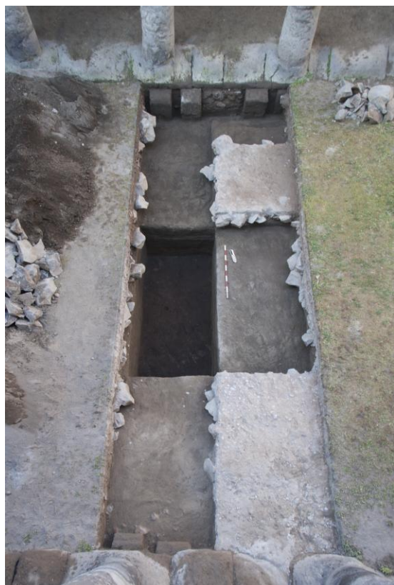
Fig. 3. View of Trench OPB 1 from the north.

almost completely unexcavated. The survey suggests the presence of further collapsed and buried buildings including a possible second story. A lower chargeability on the southern length of the resistivity line points to a drastic change in the geological composition of the area, which may confirm the presence of the ancient coastline; these results mirror those of Di Maio 7 .