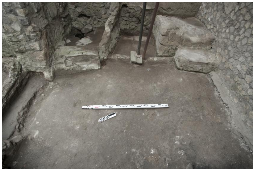
Fig. 11. Detail of Trench OPB 5 from the west.